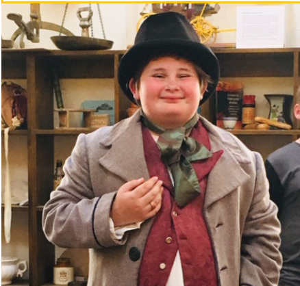
Fine Gentleman of Ballarat