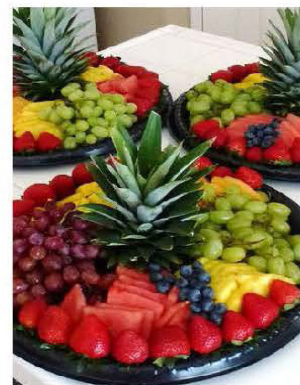
Fruit Salad Platter