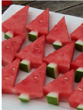
Christmas Tree Watermelon