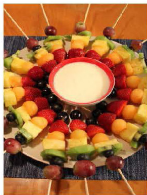
Fruit Kebab & Dip