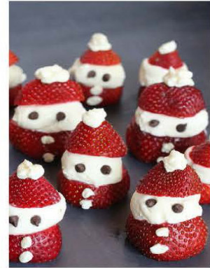
Strawberry Cheesecake Santas