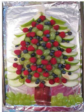
Fruit Christmas Tree