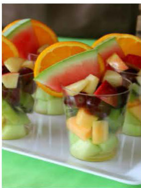
Fruit Salad Cups